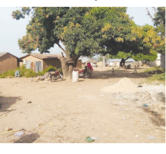
Some local people still violate rules that will ensure safer mining.

According to the non-profit Publish What you Pay Nigeria, the exploration of minerals in Nigeria by the artisanal method has occurred for over 2400 years from mining basic clays to base metals and gold. There are thousands of artisanal mining sites in Nigeria and government officials say over one million people are directly involved and another one million