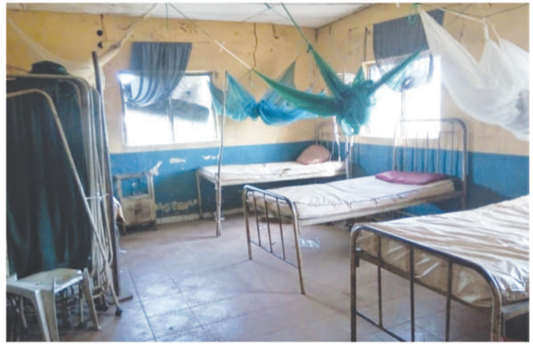
Inside the clinic set up to treat patients affected by lead pensioning

Last year, the Economic and Financial Crimes Commission (EFCC), an anti-corruption body dicate of smugglers including country.